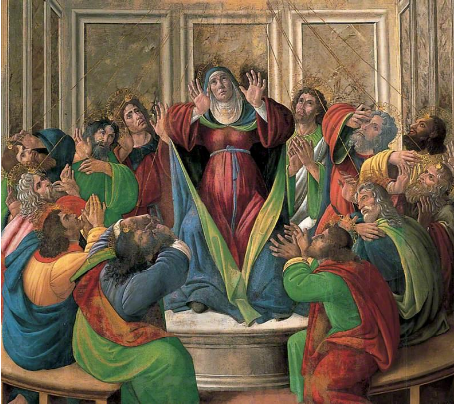
Sandro Botticelli (and workshop), The Descent of the Holy Ghost c. 1495–1505, Oil on panel, Birmingham Museum of Art, Alabama

In this vivid portrayal of Pentecost, recorded in the 2 nd chapter of the Acts of the Apostles, Botticelli provides a highly structured, almost theatrical composition centred on the Virgin Mary, who stands on a raised platform, arms lifted in awe and surrender. The apostles encircle her, gesturing upward or outward in a mix of reverence, wonder, and spiritual amazement. Golden rays stream down from above, representing the descent of the Holy Spirit – not in the form of traditional flames, but as divine light illuminating each figure with grace. The architecture enclosing the scene suggests both the upper room and a sanctified space beyond time. With its formal clarity and vibrant colour, the painting expresses the birth of the Church as both a moment of divine encounter and communal transformation.