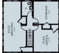
DISCOVERY HOUSE 2ND FLOOR